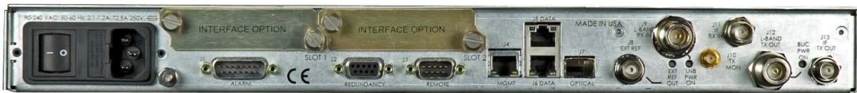
CDM-750 Rear Panel